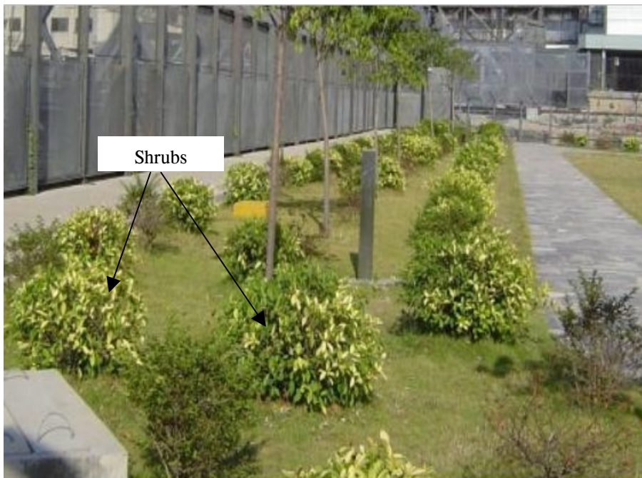
Photograph 2 Shrubs