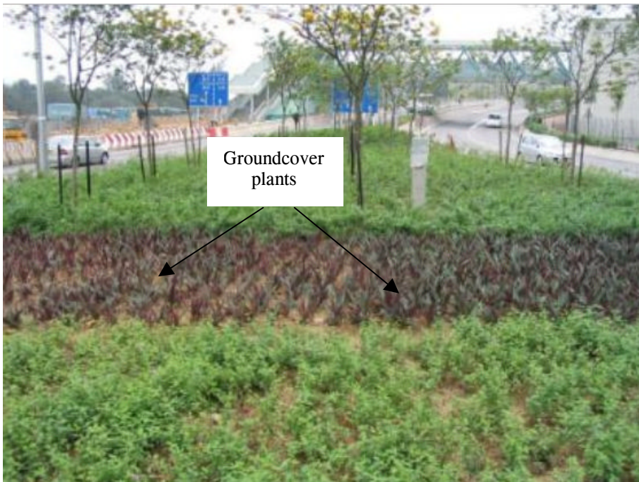
Photograph 1 Groundcover plants