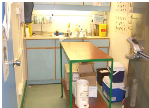
Animal inoculation room