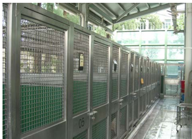
Kennel for keeping stray animals